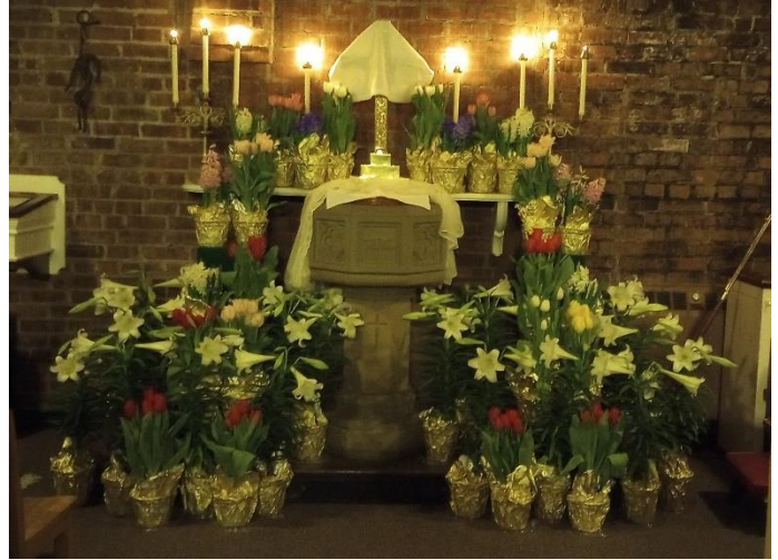
ALTAR OF REPOSE