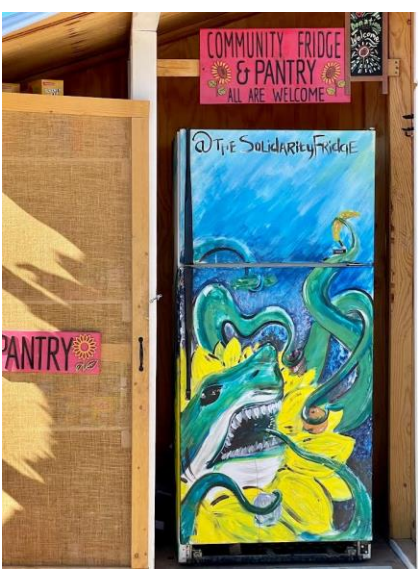
Community Fridge and Pantry