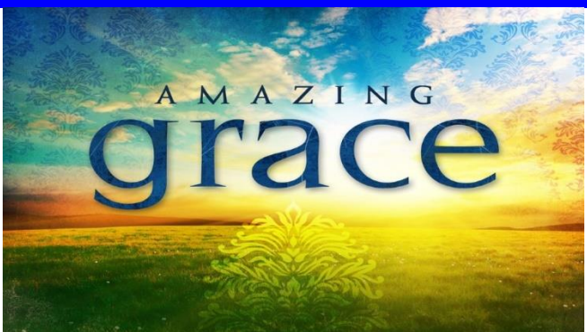
"Look, here is water! What is to prevent me from being baptized?" (Acts 8:36)

Somehow, we have come to the moment in our journey together as parish and priest that we must say goodbye. And as I sat with that fact, and with preparing to write this, my final Priest's Message for Grace Notes , the biblical story that presented itself to me was the story in Acts 8 of Philip's encounter with the Ethiopian Eunuch.