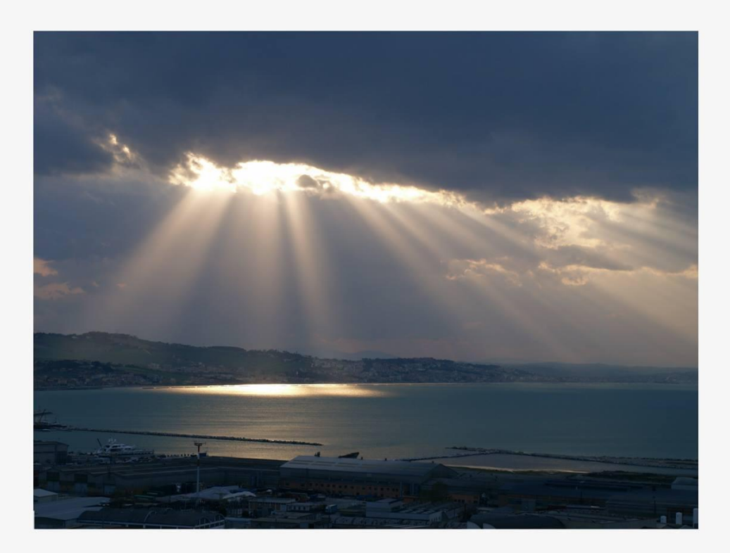
What the Day Gives

Suddenly, sun. Over my shoulder in the middle of gray November what I hoped to do comes back, asking.