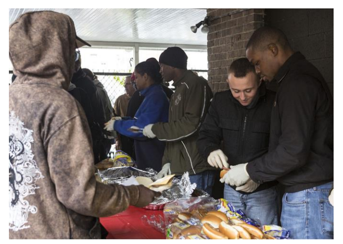
EMERGENCY SHELTER PROGRAM

Dear Grace family, as evidenced by the cold snap we are currently having, winter will be upon us soon. With winter comes the return of the ESP, the homeless shelter hosted by houses of worship here in Ossining. Last year, our downtown campus kicked off the season as host location during the month of December. For this year, we have committed to three weeks in February, the actual dates being Monday, January 31<sup>st</sup>, through Monday, February 21<sup>st</sup>.